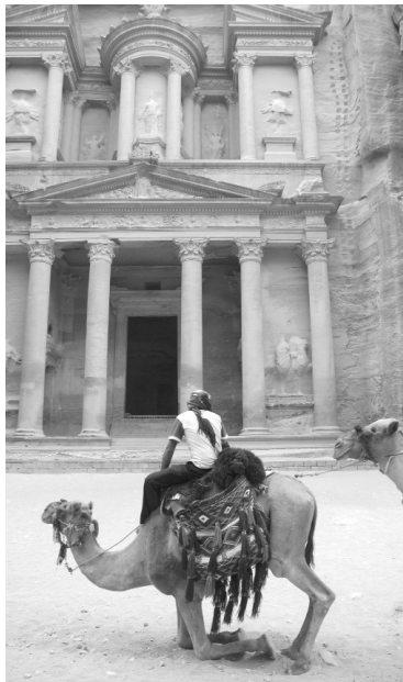
Guides on camels take guests through Petra, the ancient city of the Nabateans, south of Amman in Jordan.