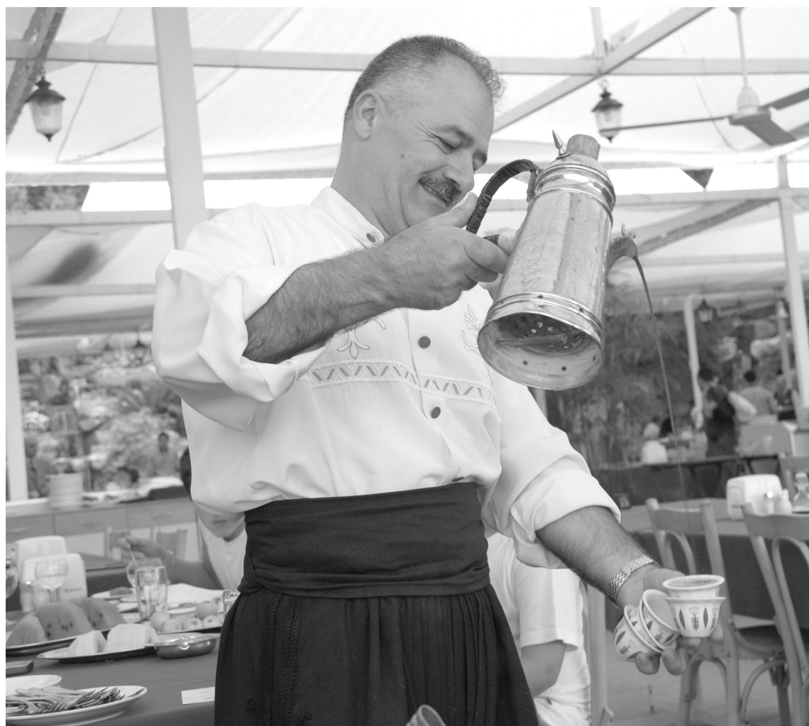
In an open-air restaurant in the mountains of Lebanon overlooking Beirut, a waiter serves Arabic coffee.