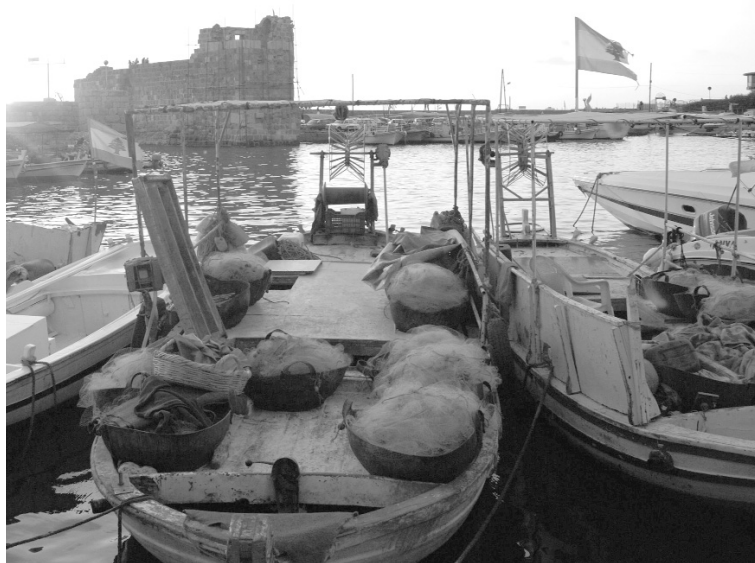
Sunset over the coast of Byblos, one of the oldest cities in the world, north of Beirut.